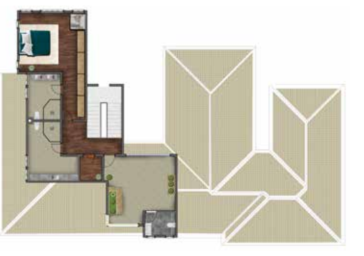
3 BEDROOMS VILLA GROUND FLOOR AND FIRST FLOOR PLAN