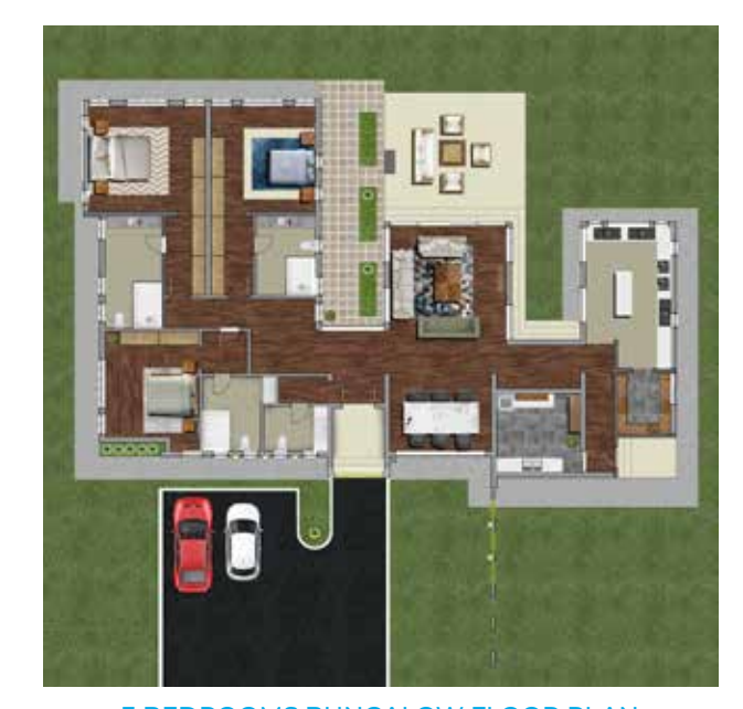
3 BEDROOMS BUNGALOW FLOOR PLAN