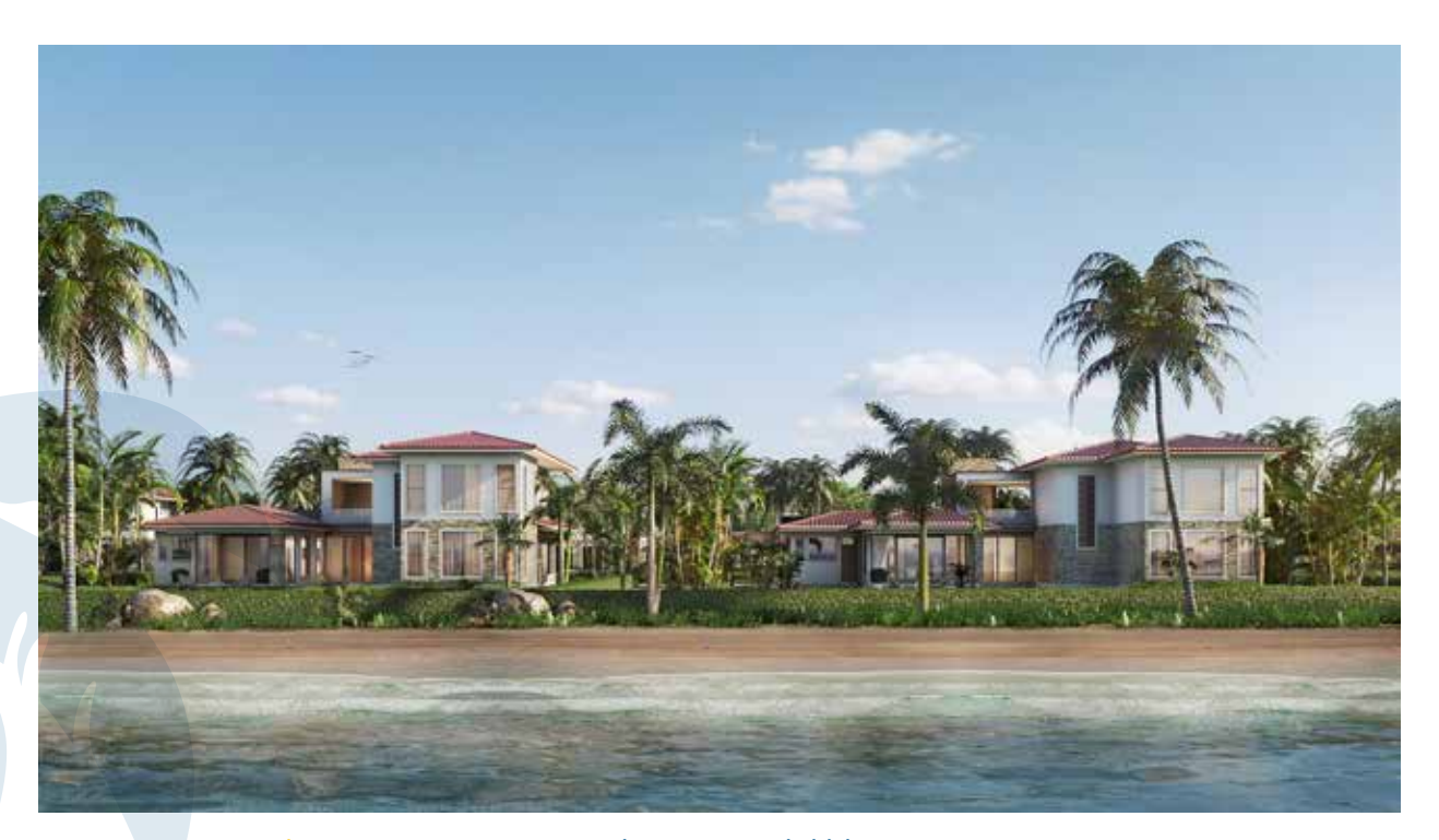
Life. Style. Elegance. Imagine the possibilities. A place to call home